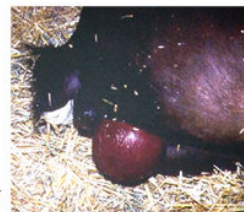
Red Bag Delivery

In very rare instances, you will see what is called a "Red Bag Delivery" (premature rupture of chorioallantois).